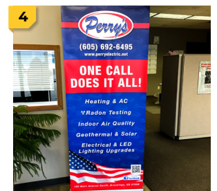
1 - Multi-dimensional aluminum sign | 2 - Perforated vinyl window graphics 3 - Vinyl on contour cut PVC with standouts | 4 - Retractable banner